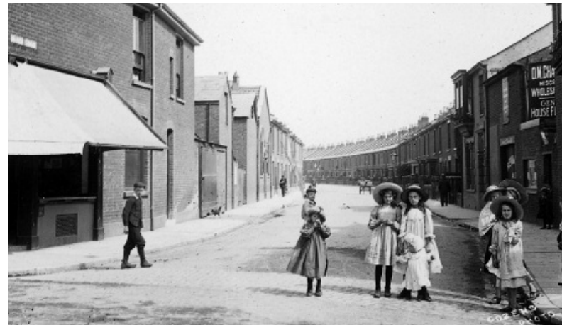
A photographer was obviously a rare visitor to Margate Road, early in the century