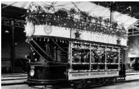
Illuminated trams were often used to promote events in Portsmouth and Southsea.