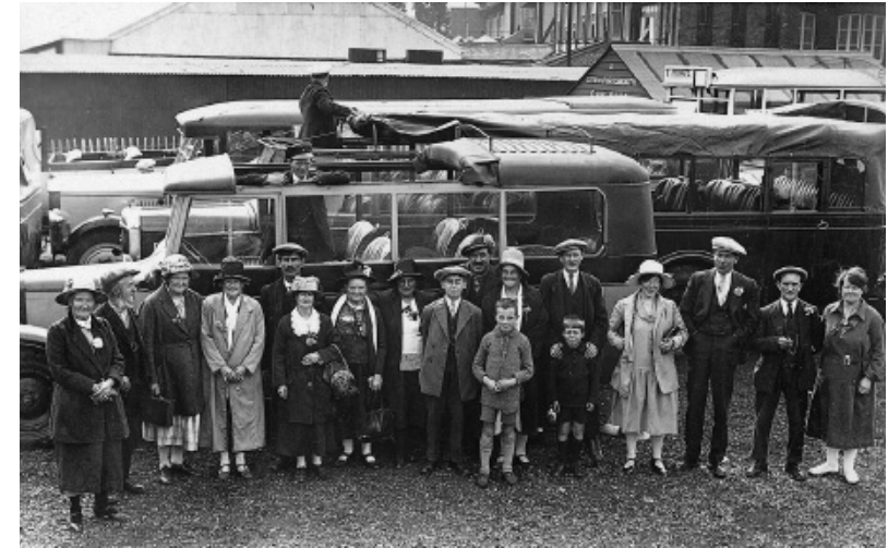
A picture of day trippers dated August 1932