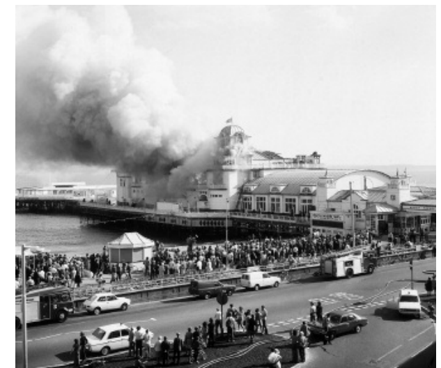
Crowds line the seafront in August 1974 as smoke and flames belch from South Parade Pier.