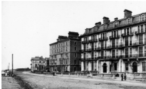
The resort of Southsea in its early days at the end of the nineteenth century with Beach Mansions to the right of the picture.